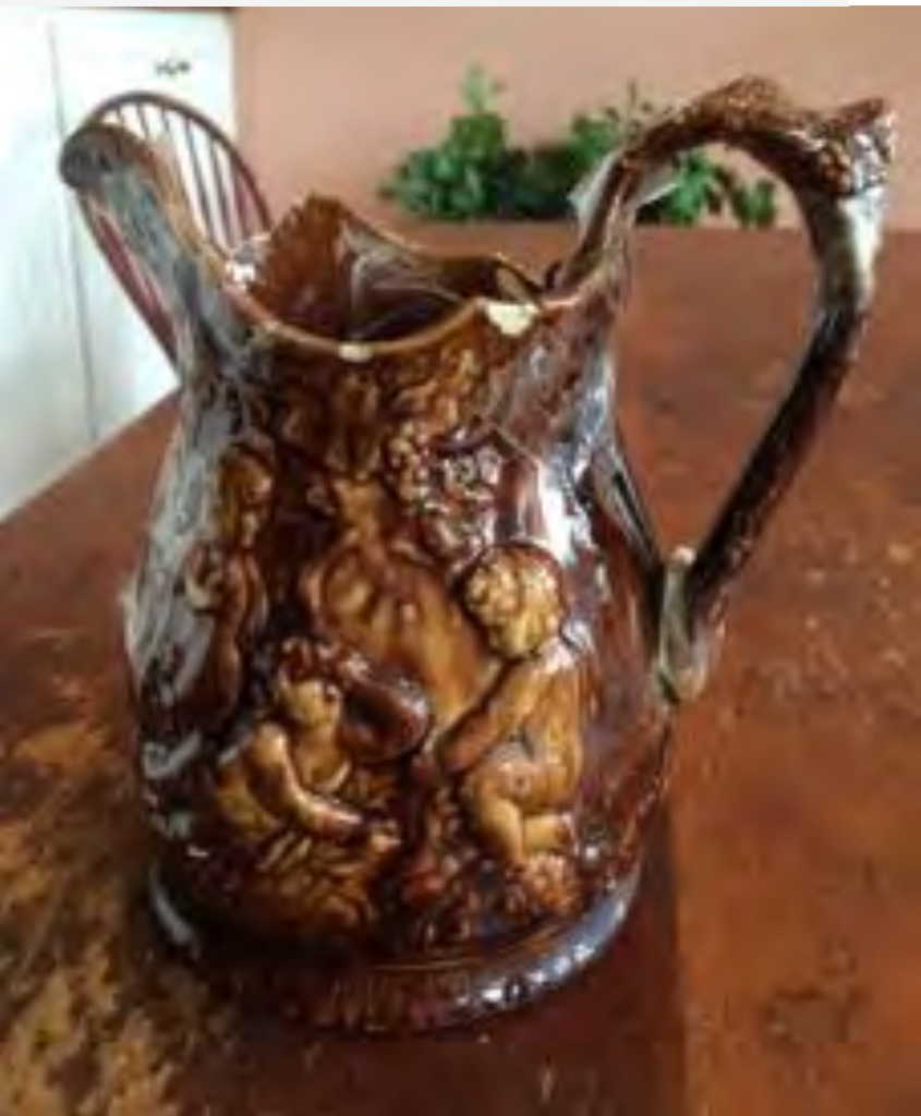
Rockingham Jug c. 1870