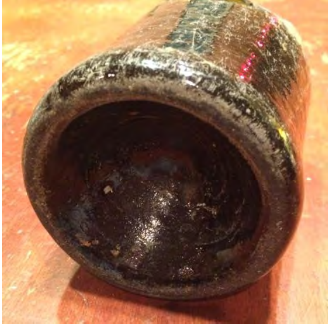
9" bottle c.1750. Wear marks indicate the bottle was picked up and put down tens of thousands of times (typically on soft wood tables) over decades.