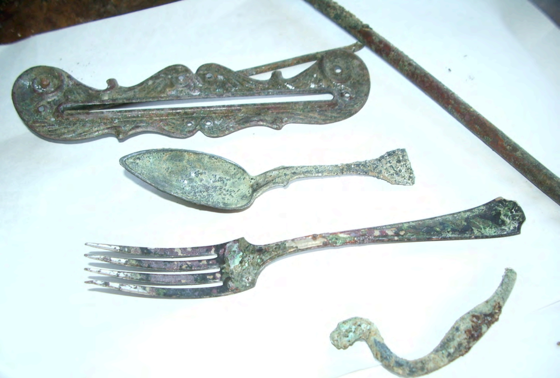
Music Stand, Spoon, Fork, drawer handle