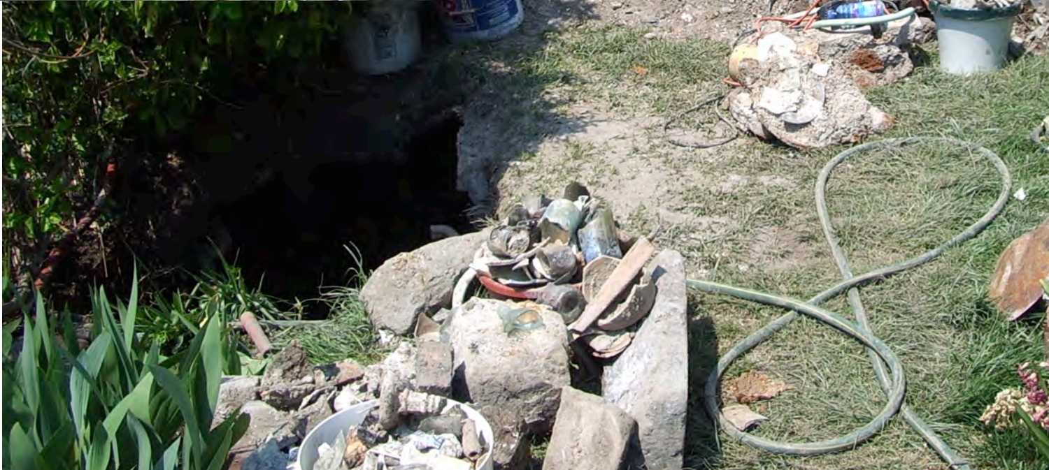
The dig: Brick lined 6' to water