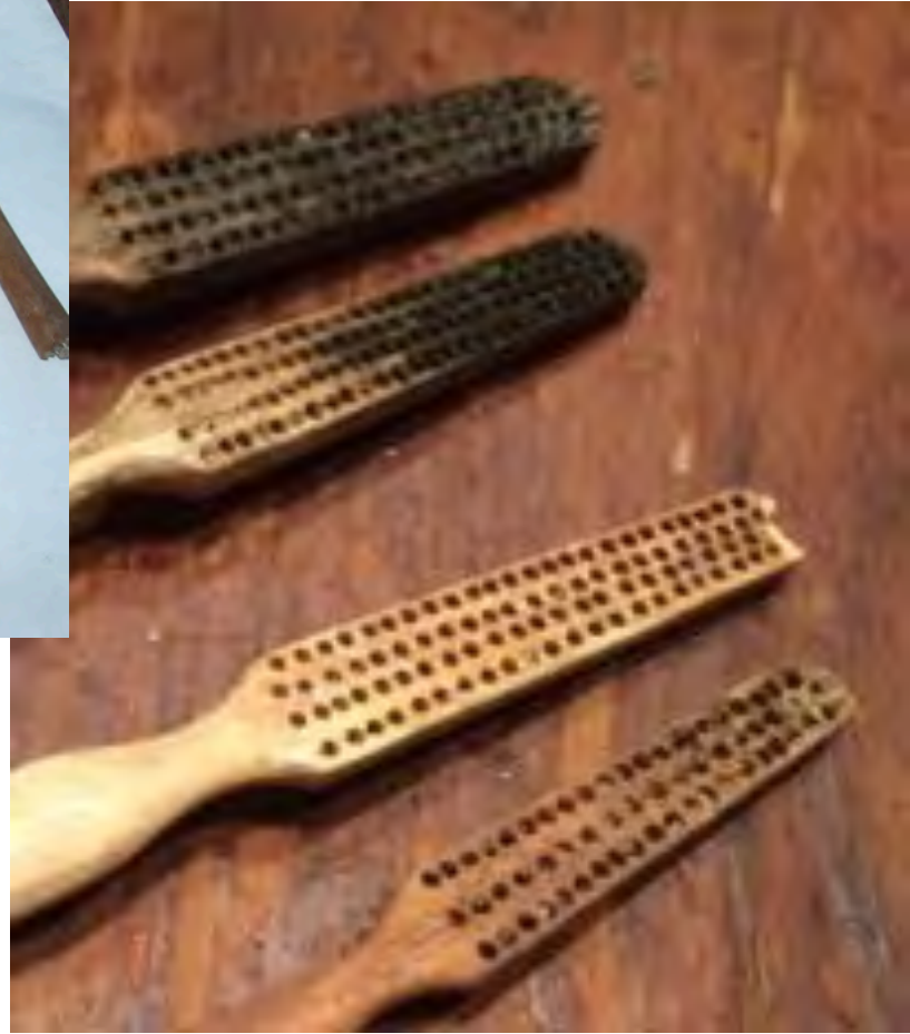
Early hand-drilled bone toothbrushes. Small bundles of hog bristles were glued into the individual holes.