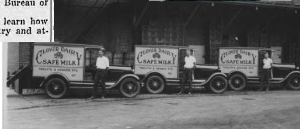
Hagley Museum and Library