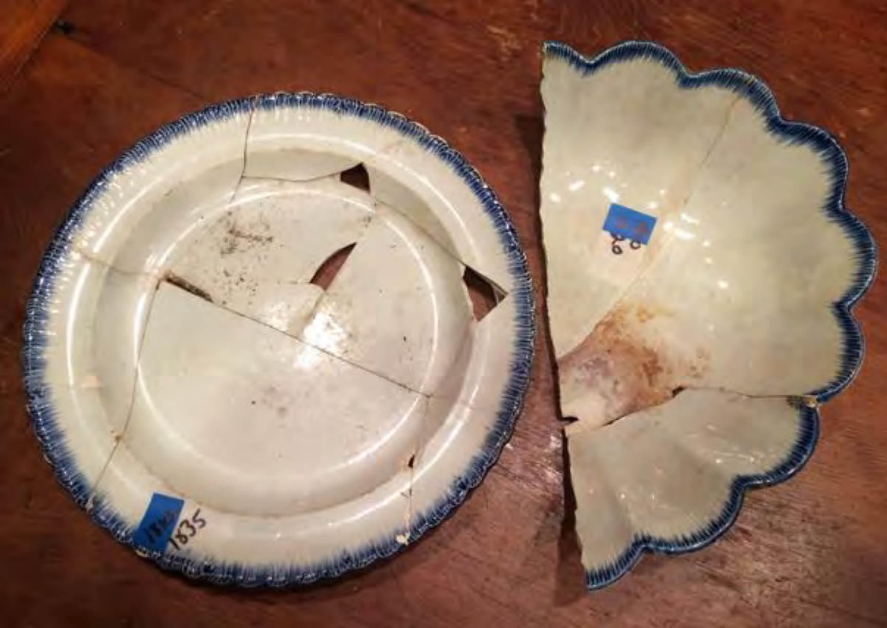
Edge decorated pearlware c. 1800-1830