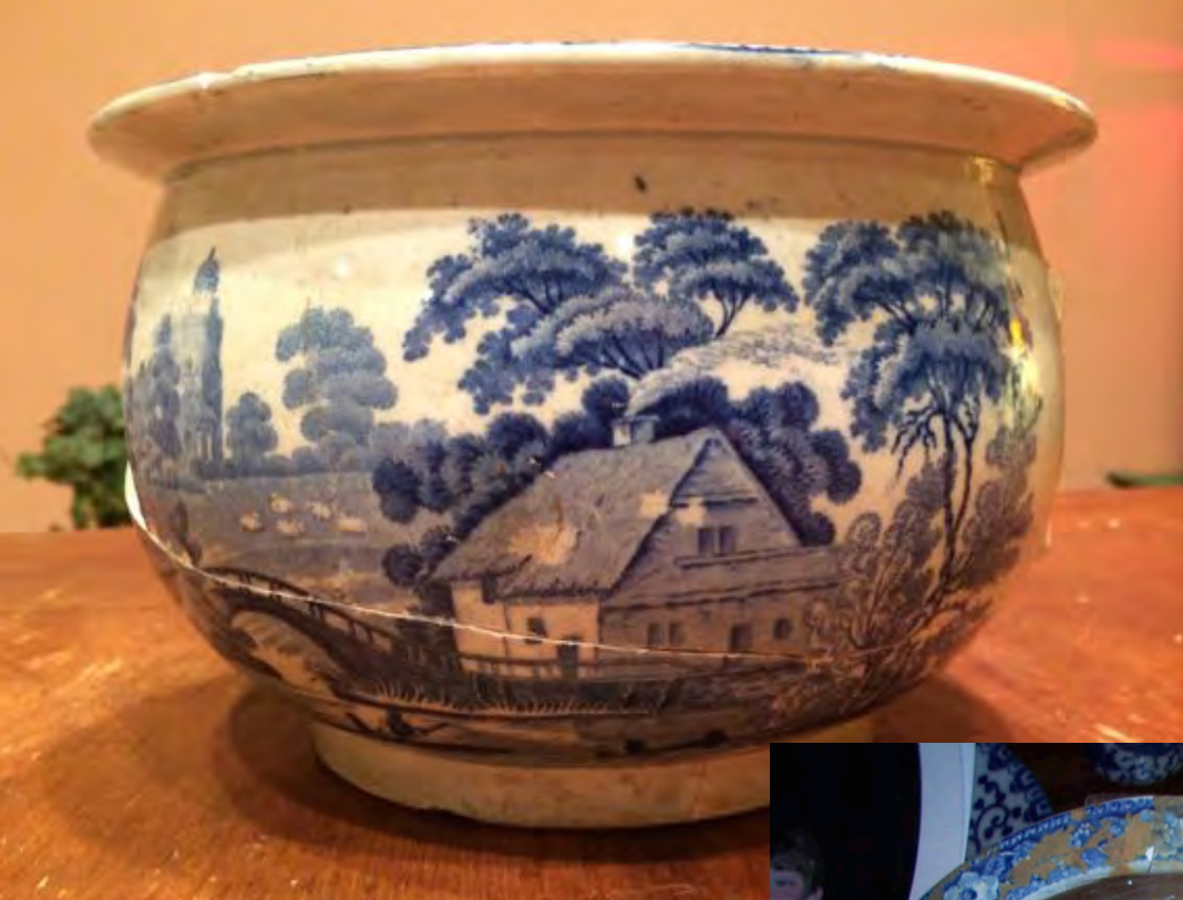
Transfer decorated pearlware chamber pots c. 1800-1820