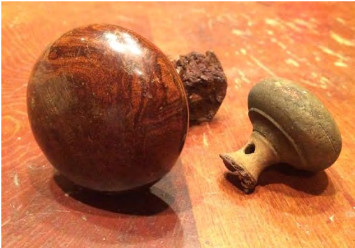
Victorian Brown Mineral Knob